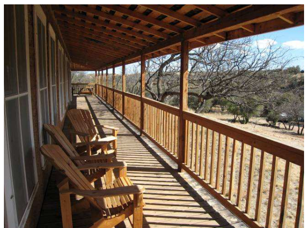
Headquarters building porch and chairs