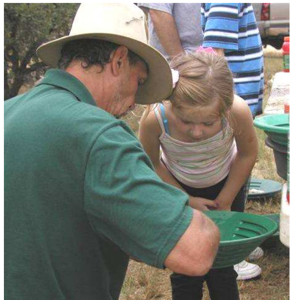
Young "prospector" looks for "color" at the gold panning demo. (From the 2008 open house)

http://www.fs.fed.us/r3/coronado/forest/heritage/kcamp/kcamp_rentals.shtml