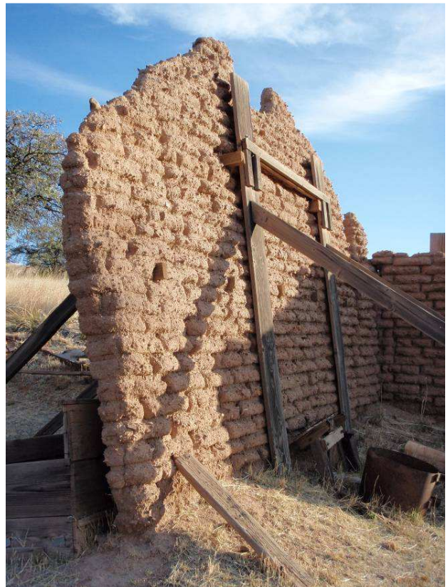
Leaning barn wall