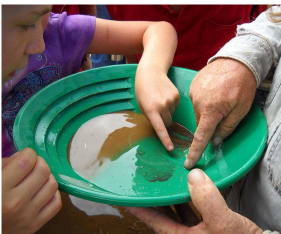
Youngsters enjoyed finding specks of gold.