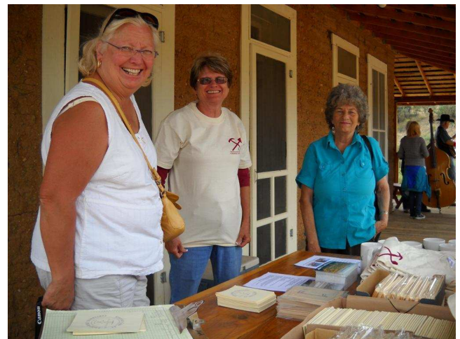
Guests appreciated the live Bluegrass music and supported our efforts with plenty of t-shirt, mug and card purchases.