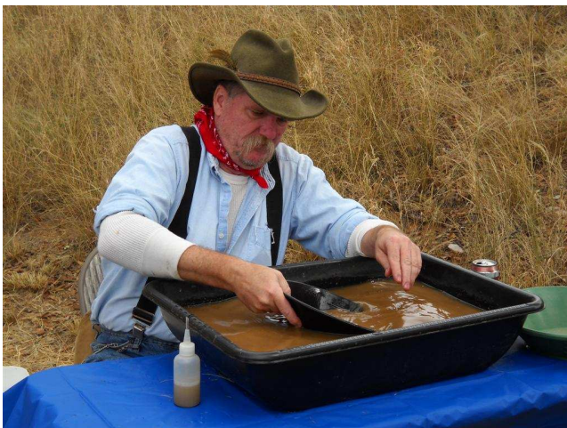
The Desert Gold Diggers were on hand to provide their always-popular gold panning demonstration.

The new approach for having guests bring a picnic lunch seemed to work out pretty well.