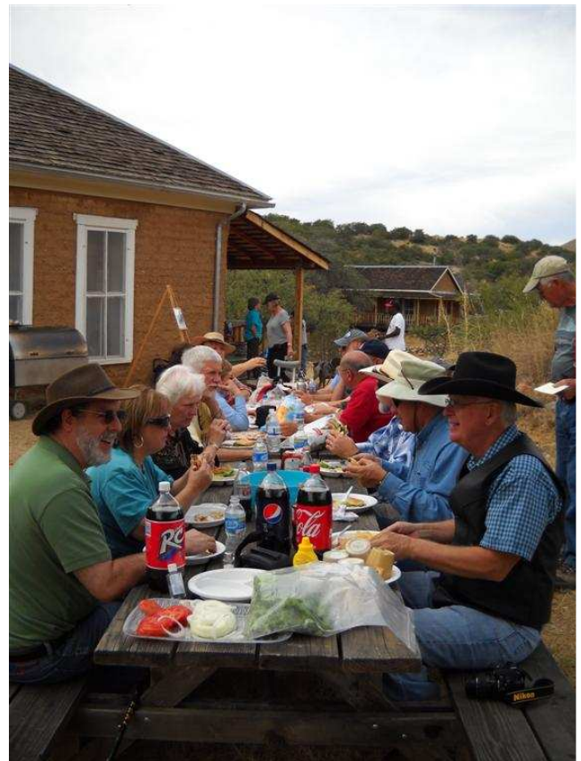
Everyone enjoyed the picnic-style lunch arrangements. Next year we may need more picnic tables!