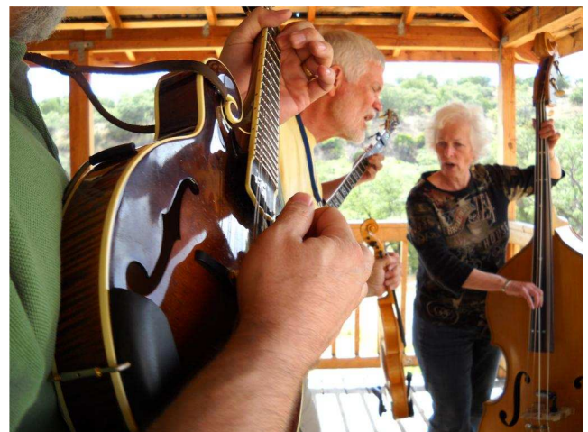
The Desert Bluegrass musicians were a big hit for the volunteers and guests. They provided period background music for much of the day.